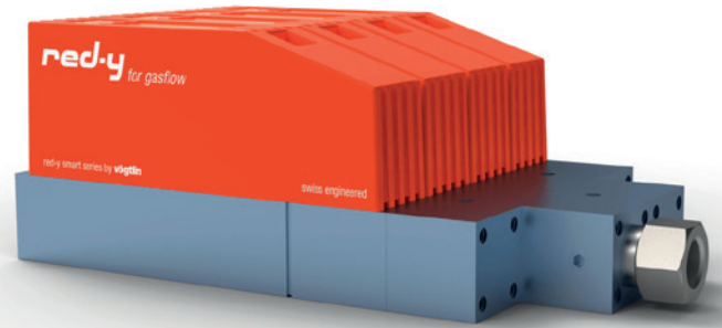
Fig. 3 Vögtlin offers modular MFC systems based on your demands and requirements.

Inflow gas should be maintained at a very stable level in the coating process to avoid uneven coating and significant spots and negatively impacting the general energy of particles in the coating, which is not favorable for reactive deposition. A complicated gas distribution system requires numerous of process gas branches. Installation and commissioning of single channel gas circuits are tedious with heavy work load. In addition, this system typically reduces efficiency, and generates multiple leakage points. Human operation errors (wrong connection of gas mixing and connection circuits) also can negatively impact operations.