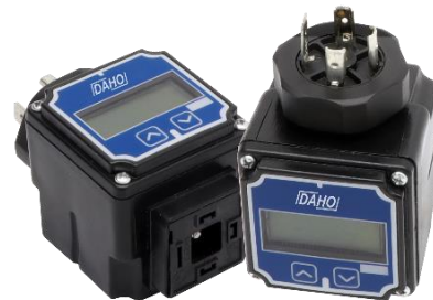
Square Indicator LCD, product code AC45