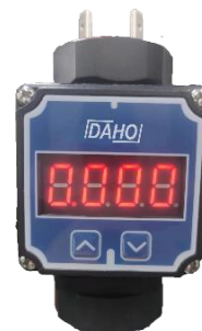
Square Indicator LED, product code AC46